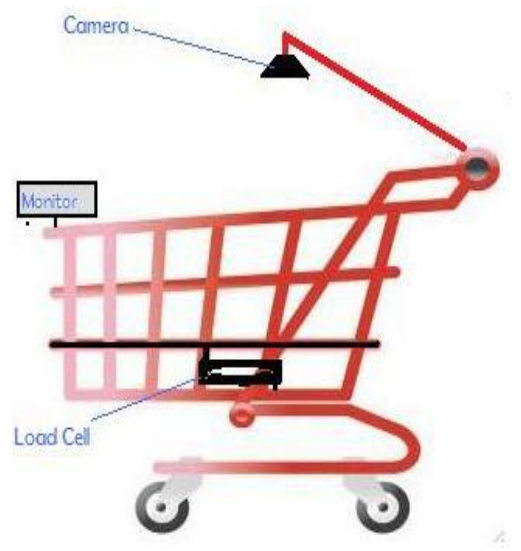
Figure.1. Smart Shopping Cart

Every customer will be identified by the ID of the cart he/she picks for shopping. The main Station at the payment counter consists of a database that stores information of all the products, and a sensor mote to communicate with all the Smart Carts in the mall. When a customer starts shopping, he/she has to scan the barcode of the product with the barcode scanner present at the cart, after which the product has to be put into the basket. The barcode of the product is transmitted by the mote to the main Station using the IEEE 802.15.4 (ZigBee Protocol) [4] over the ZigBee network. ZigBee is chosen along with the IEEE 802.15.4 compatible sensor motes because they are easily available and mass produced. In reply, the main Station sends relevant information about the product, which is used in the decision-making process at the cart. In order to handle all the cases of mistake/dishonesty, the design includes the use of image processing at the cart. After the customer finishes shopping, he/she then proceeds to the payment counter to pay the bill amount and is assisted by an attendant only in the case the system detects discrepancy in the self-checkout process of the customer as shown in figure 2.