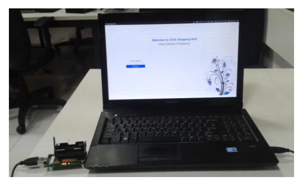
Fig.3. Prototype Model of Main Station

The experimental set-up is tested for various test cases, with various products tested for all the possible cases mentioned in