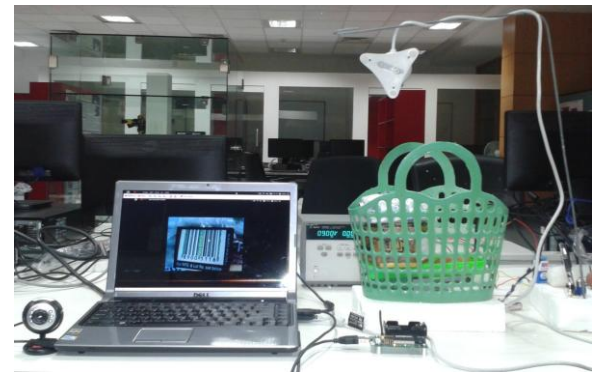
Fig.4. Prototype Model of Smart Shopping Cart