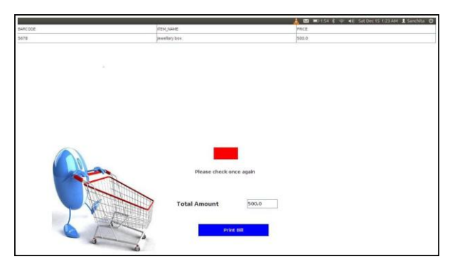
Fig.6. Generate Bill with Red Indicator

Section II. When the system is tested with a single Shopping Cart and a Main Station, it gives the correct result for all the cases except for the case when the lighting condition is very poor, i.e., when the lighting condition in the environment is very dim/dark. This is because the object in the image cannot be recognized because of the darkness, due to which the SIFT algorithm fails to extract the key points of the object. The lighting in [14] a store is expected to be bright. Low lighting conditions can be indicated on the smart cart by setting the attendant flag. This attendant flag is the same as the one set when weight or images do not match.