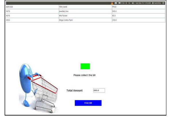
Fig.5. Generate Bill with Green Indicator